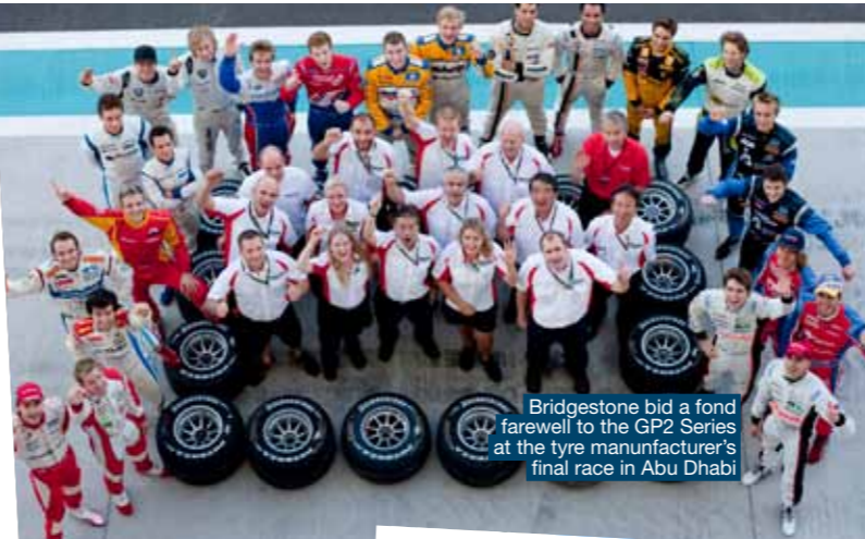
Bridgestone bid a fond farewell to the GP2 Series at the tyre manufacturer's final race in Abu Dhabi