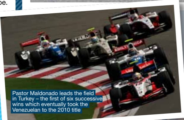
Pastor Maldonado leads the field in Turkey – the first of six successive wins which eventually took the Venezuelan to the 2010 title