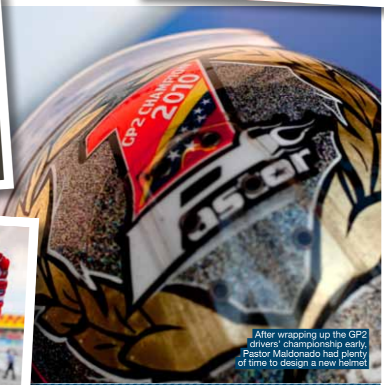
After wrapping up the GP2 drivers' championship early, Pastor Maldonado had plenty of time to design a new helmet