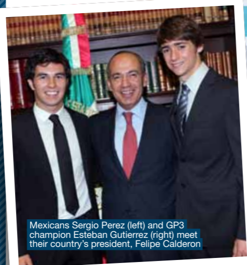
Mexicans Sergio Perez (left) and GP3 champion Esteban Gutierrez (right) meet their country's president, Felipe Calderon

MC: The teams received one car in October, and the first engine was delivered two weeks ago. The first shakedown is at Paul Ricard on 18 November, with each team running one car. This happened while the main series was going on, so the teams had to concentrate in two directions. But all the GP2 freight for the main series final round left Europe at the end of September, so while it seems busy, it was planned to allow the teams to cope.