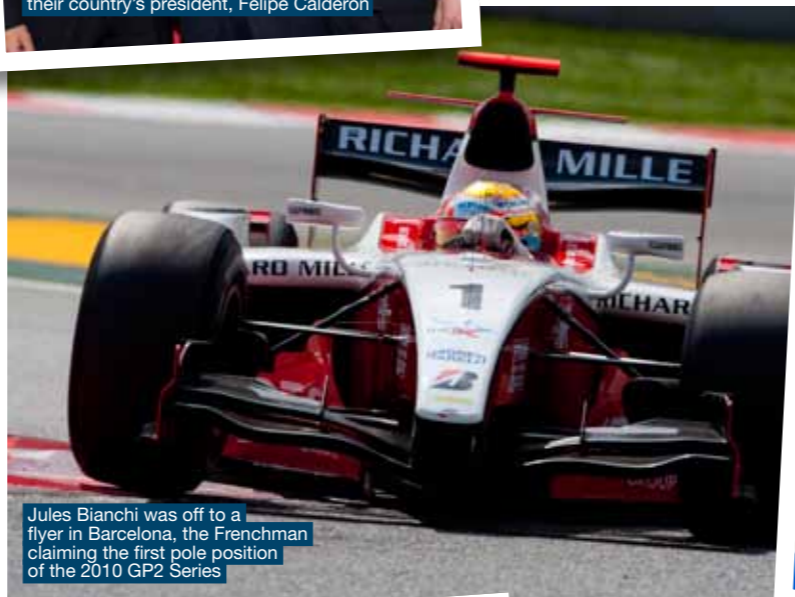
Jules Bianchi was off to a flyer in Barcelona, the Frenchman claiming the first pole position of the 2010 GP2 Series