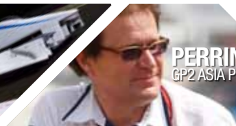
PERRIN GP2 ASIA PREVIEW